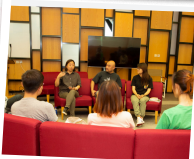
Sharing Session: 職人·真人圖書館活動 24 Apr 2019