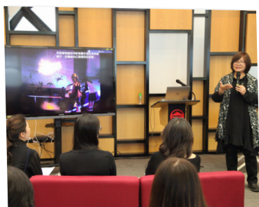
Art History and Curating Seminar Series: 不可能的可能— 論數位科技與博物館展示再現 4 Apr 2019