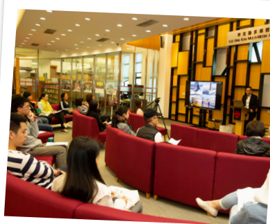
Art History and Curating Seminar Series: Marketing and Merchandising Treasures in the Museum-land 1 Apr 2019