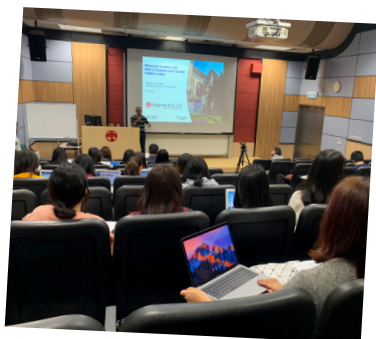
Seminar: Research Smarter with Web of Science and Journal Citation Index 14 Feb 2019