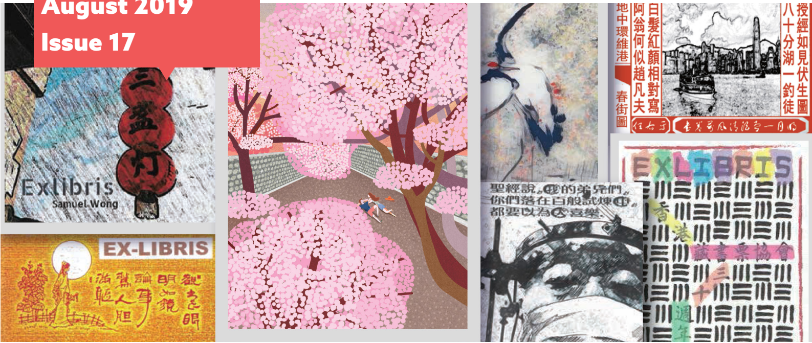
Hong Kong Exlibris Association 30th Anniversary cum Computer Generated Design Exhibition