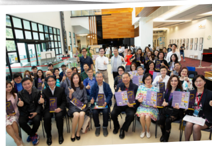
Hong Kong Exlibris Association 30th Anniversary cum Computer Generated Design Exlibris Exhibition 3 Apr - 24 May 2019