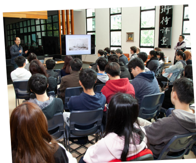
Booktalk at Library: Inseparable - The Original Siamese Twins and Their Rendezvous with American History 11 Mar 2019