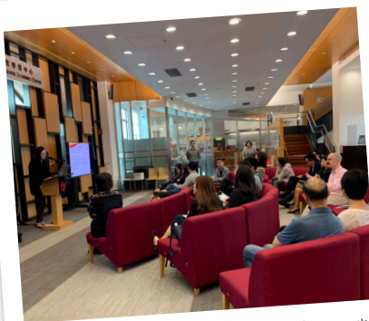
Avoidance of Breach of Intellectual Property Rights in University Education Workshop 22 Feb 2019