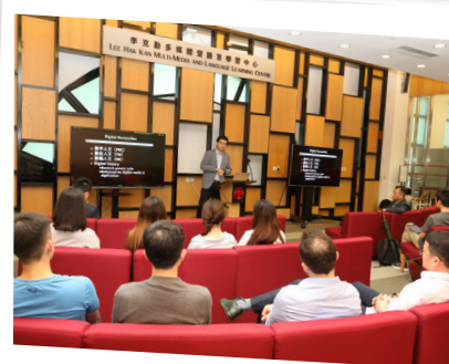
Seminar: The Tortuous Path of Digital History in the Chinese Humanities 30 Apr 2019