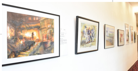
Embrace Life Watercolor Exhibition (27 OCT- 12 NOV 2018)