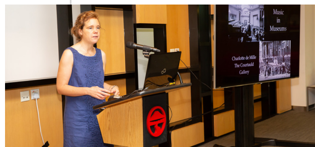
Art History and Curating Seminar Series