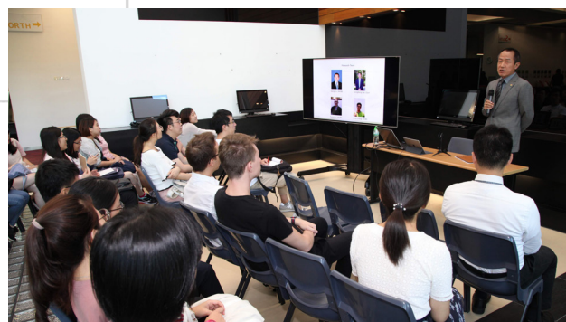
Public seminar on "Construction of Mainland China- Hong Kong Economic Integration Index and Its Applications to Facilitate Public Policy Research in Hong Kong"