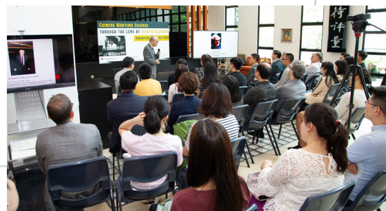
Opening Ceremony of the Exhibition & Talk on Joseph Needham and the "Science and Civilization in China": An East-West Journey of Destiny (08-25 OCT 2018)