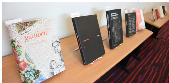
Best Book Design from Germany 2017 Exhibition (10 SEPT- 05 OCT 2018)