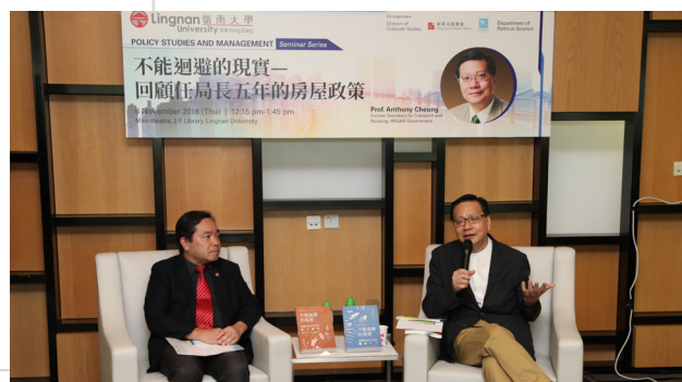
Seminar Series on Policy Studies and Management