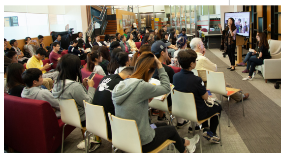
Service-Learning Showcase cum Seminar Campus Farming and Community Building at Lingnan (16-23 NOV 2018)

https://gallery.ln.edu.hk/lib/service_learning_seminar_2018/