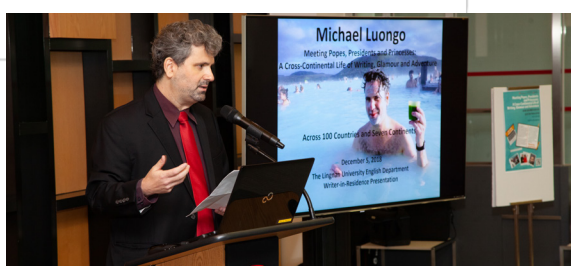
Meeting Popes, Presidents and Princesses: A Cross-Continental Life of Writing, Glamour and Adventure

https://gallery.ln.edu.hk/lib/service_learning_seminar_2018/