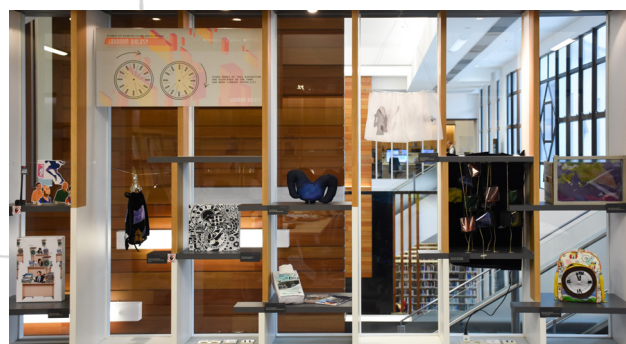
Random Walks: Exploring Authenticity and Randomness through Art Practices (01 DEC 2018 - 13 FEB 2019)

This biannual newsletter is published by